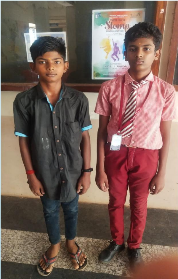
Category under 17 Boys Doubles RUNNER

21.08.2023, Monday: Zonal level Carrom Match held at BHEL Community Centre, Trichy.