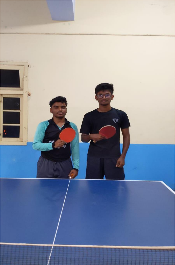
Category under 19 boys Doubles Runner position