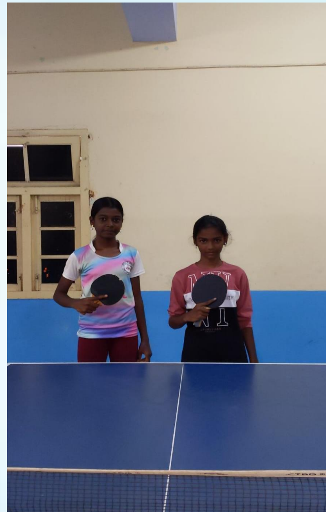
Category under 14 Girls Doubles RUNNER position