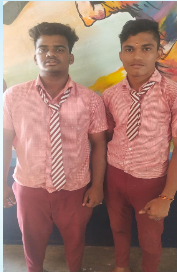
Category under 19 boys Doubles WINNER