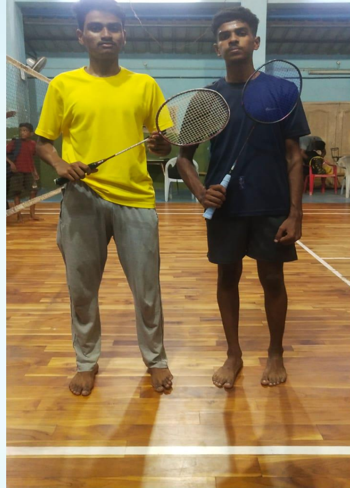
Category under 19 boys