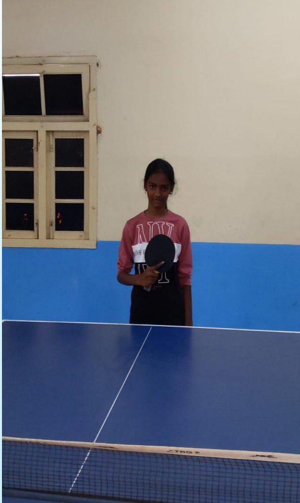
Category under 14 Girls Singles RUNNER position