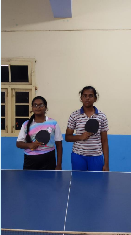
Category under 17 Girls Double RUNNER –position