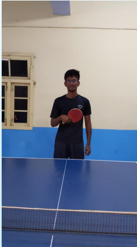
Category under 19 boys Singles –Winner position