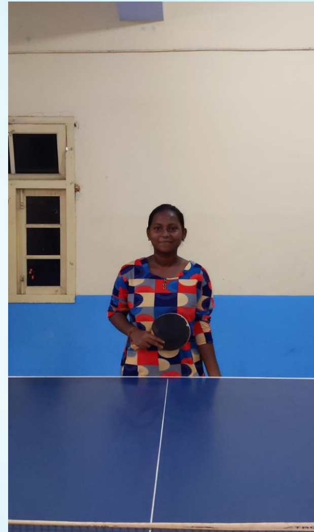
Category under 19 Girls Single RUNNER -position