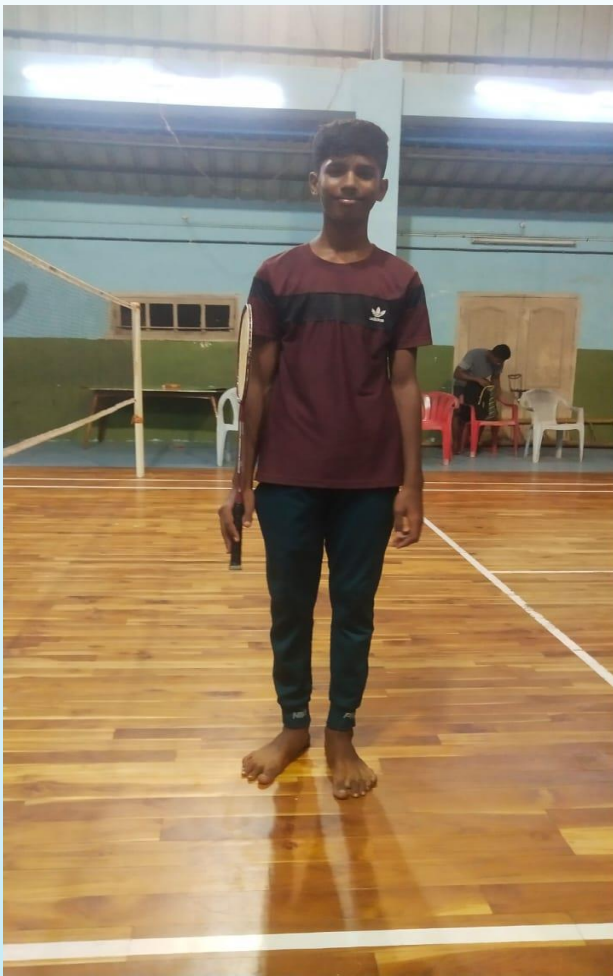
Singles RUNNER -position