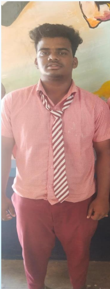
Category under 19 boys Singles WINNER