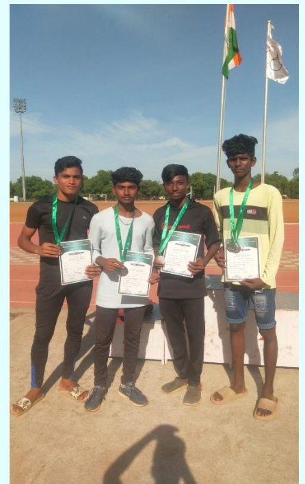
Third place in the Events 4x100 Relay